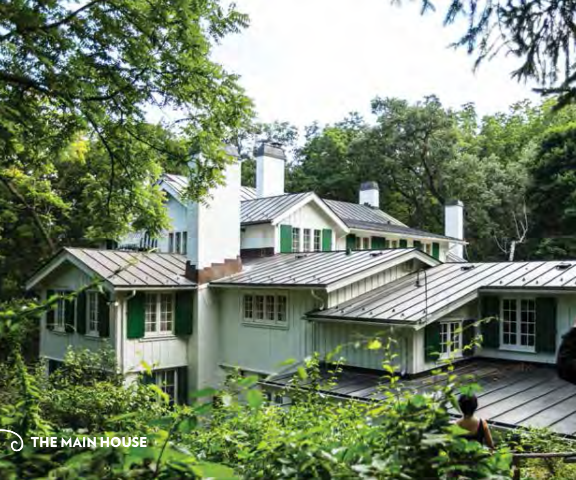
THE MAIN HOUSE